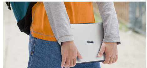
Light weight at 2.65 lbs with two grip rails for better holding traction reducing any slipping incident