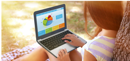
Anti-glare display great for outdoors as well