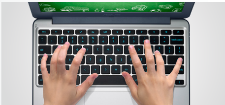
Spill-proof & 2mm travel distance keyboard