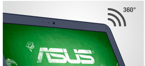
360° Wi-Fi antenna for stronger reception