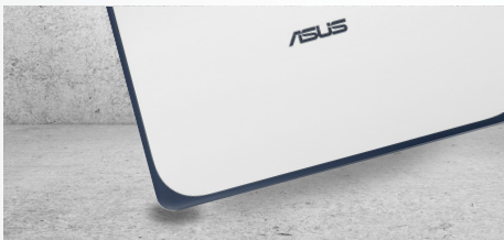
Robust, reinforced rubber wrapped protective guard