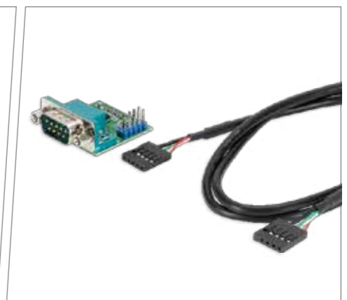
ASUS Serial Port Extension Card