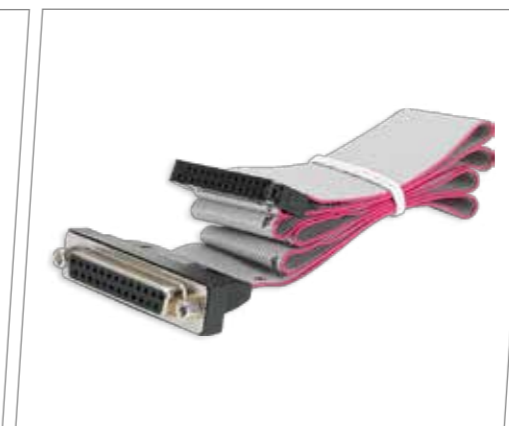
ASUS Parallel Port Cable