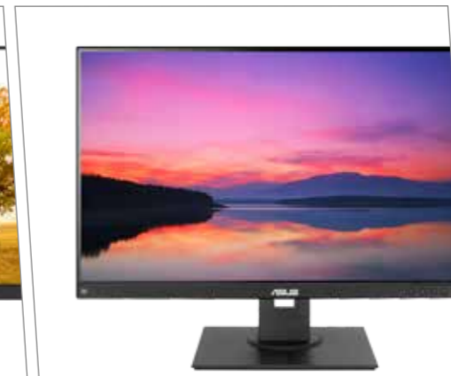
ASUS 27" Business Monitor (BE279CLB)