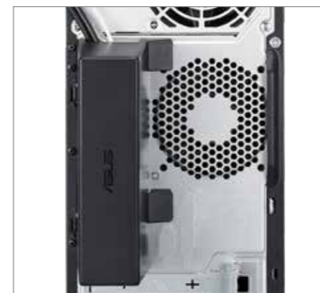
ASUS Back I/O Protector