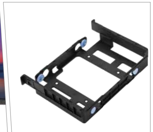
HDD Tool-less tray