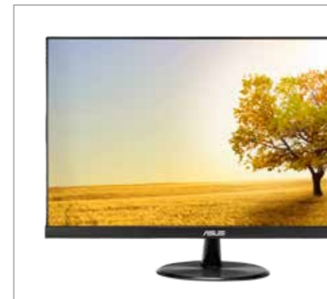
Asus 27" Eye Care Monitor (VP279N)